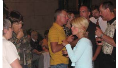
(LEFT & BELOW) Joslyn members enjoy a festive reception and tours of artwork made with heat, such as glass, metal, and sculpture.