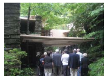
(RIGHT) CAS members visit Frank Lloyd Wright's masterpiece, Fallingwater .