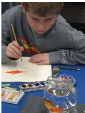
(Above) A young visitors tries his hand at watercolor, with live goldfish as models.