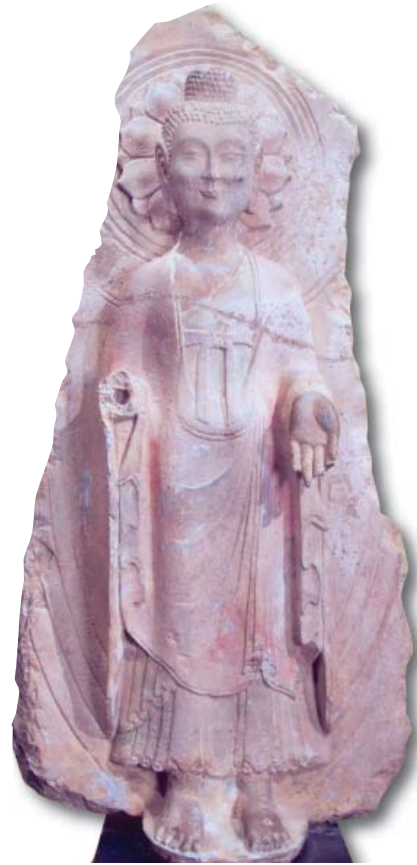
PICTURED ABOVE: Chinese, Northern Wei Period (386–534 CE), Standing figure of Buddha, stone, Anonymous Gift

Paul Landacre (American, 1893–1963), Growing Corn , 1938, wood engraving