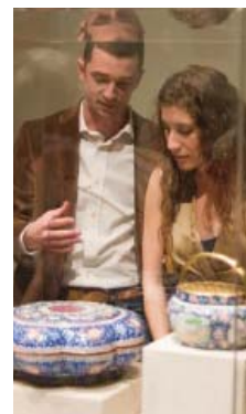
(ABOVE, LEFT TO RIGHT) A toddler is drawn to Joslyn's Eight-panel screen ; a sampling of the hors d'oeuvres reception provided by exhibition-sponsor P.F. Chang's China Bistro; members view the 18th-century Wedding sweetmeat box (private collection).